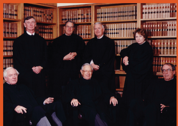
Chief Justice Mason bench.